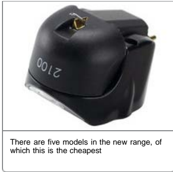
There are five models in the new range, of which this is the cheapest

Like You like this. Unlike · Add Comment · Admin Page · Error You like this. Be the first of your friends to like this. Unlike · Add Comment · Admin Page · Error